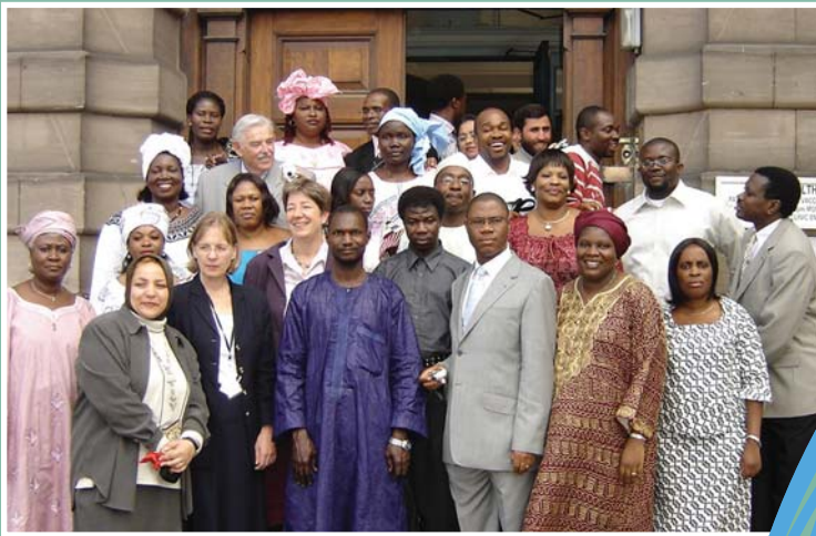
Diploma in Reproductive Health course at Liverpool School of Tropical Medicine.